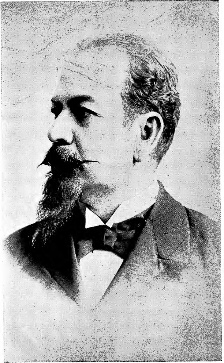
GOVERNOR DON MIGUEL AHUMADA